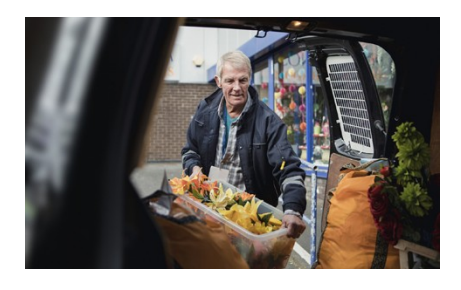
New pathway for converting from casual to permanent

It is important to note that this definition will focus on the true nature of the employment rather than just the written terms of the employment contract. It's important to be aware that even if there is an absence of a firm advance commitment to continuing and indefinite work the employment will be assessed on the basis of the 'true nature' of the employment relationship.